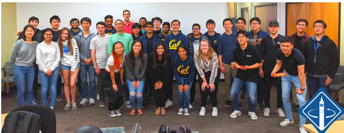
Our 2020-2021 Management Team

We believe that through these traditions, and many more that we hope to start with you, we will further promote our mission and values throughout the Berkeley community. By forming a foundational partnership with your organization, we believe that, together, we can inspire students for anything!